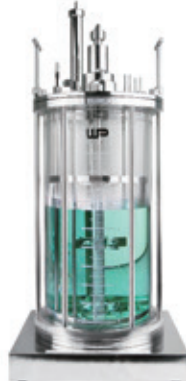
10L Single Wall Vessel with Heating base unit