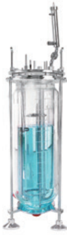
5L Air Lifter Vessel