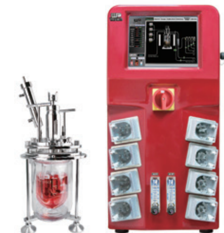
1L Double Jacketed Vessel