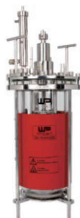
5L Single Wall Vessel with Heating blanket