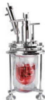
1L Double Jacketed Vessel